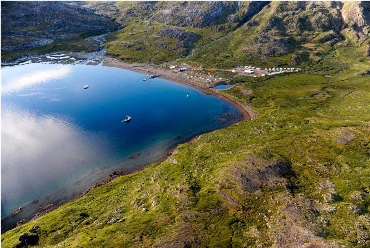
Torngat Mountain Base Camp.

Hike the mountains barren of trees but not of life; boat the seas and fjords filled with whale and seals and swimming polar bear; walk the fields carpeted with berries; speak with the Inuit who call this land home; and feel the spirits that give the Torngats their name.